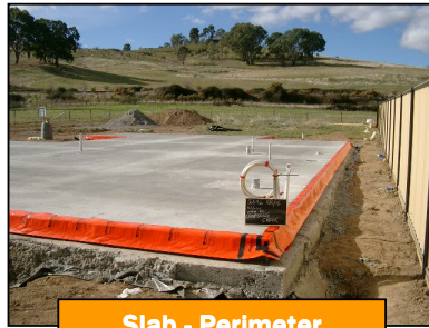
Slab - Perimeter